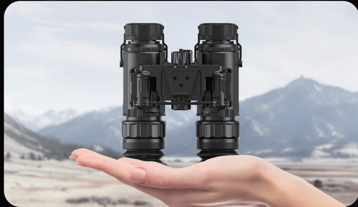
Small Size and Low Weight