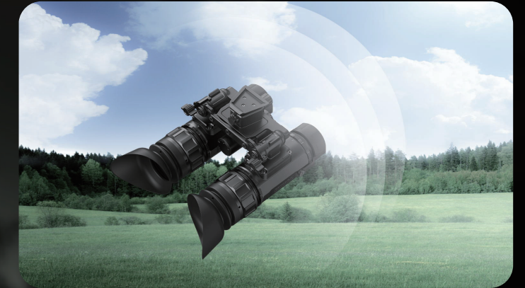
Strong Light Protection