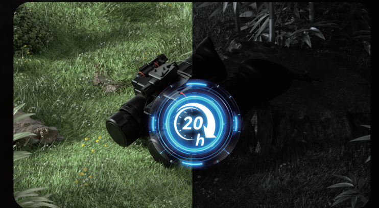
Working Time up to 20h