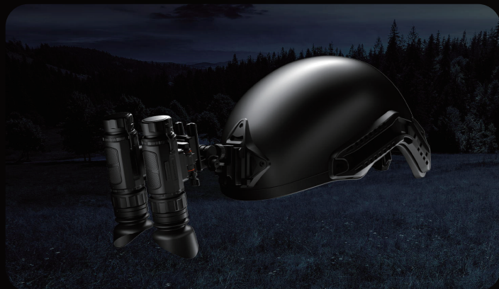
Auto Screen-off for Upward and Sideward Tilting